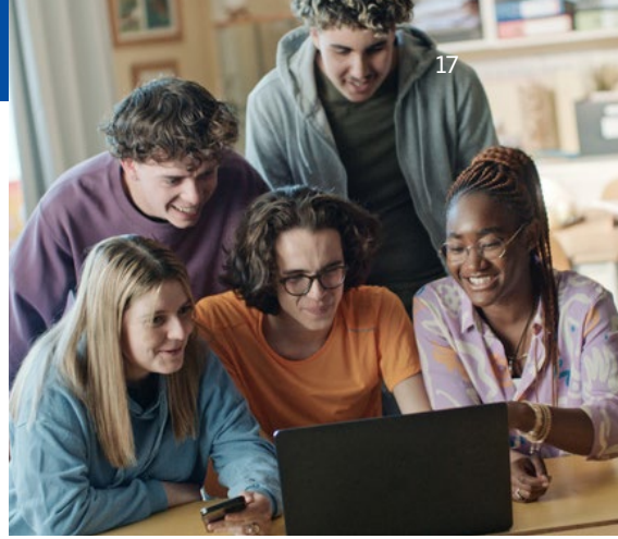
Virtual role Play game

The European Parliament is the only directly elected EU body. Every 5 years, 450 million Europeans voters choose the Members of the European Parliament (MEPs) to represent them. Members work on their behalf, debating, shaping and passing laws on issues central to the daily lives of people. The Parliament: