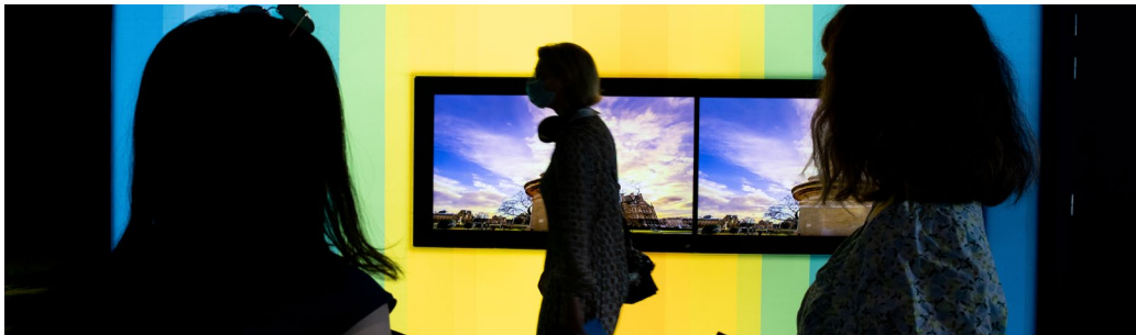
Visit the European Parliament