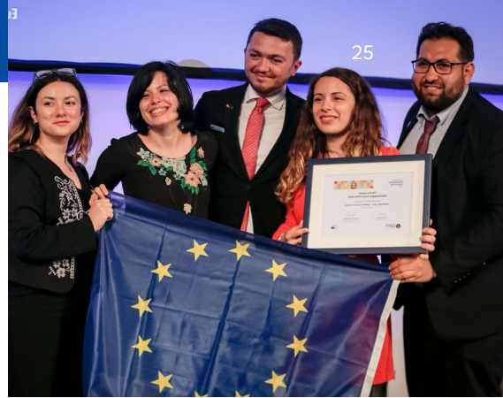
European Charlemagne Youth Prize

The purpose of the last module is to provide young people with ideas of actions that they can take to make a first step towards becoming an active citizens and create the change they want to see.